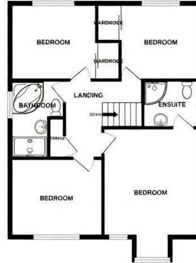
1ST FLOOR 63.2 sq.m. (680 sq.ft.) approx.